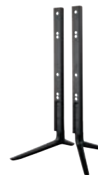
Foot Stand SBM-3240ST