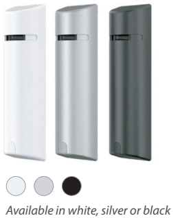
Available in white, silver or black

Low profile remote head camera lens modules and housings are designed to be strategically placed near entrances and exits. Available in flush and surface mounted options, these modules easily integrate with the aesthetics of any given structure.